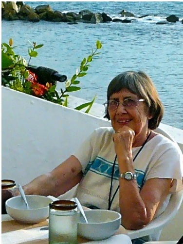
Eating as usual, on the deck of a friend's apartment which is at beach level, so you get a glimpse of the bay behind me.