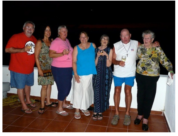
"Party at the penthouse" is an annual event put on by friends who own a week in the penthouse apartment atop one of the two tower buildings at our resort.