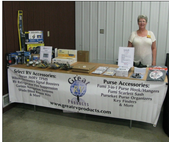
Great RV Products showed up with great products.