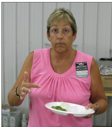
This is really good!