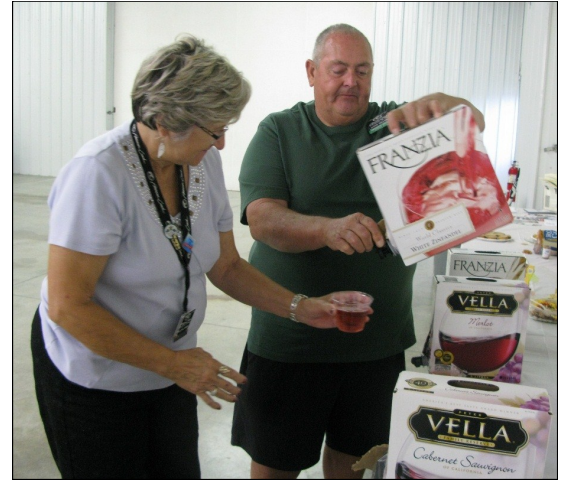
The best times start (and end) with wine!