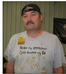
RVing is sometimes a dirty bussness.