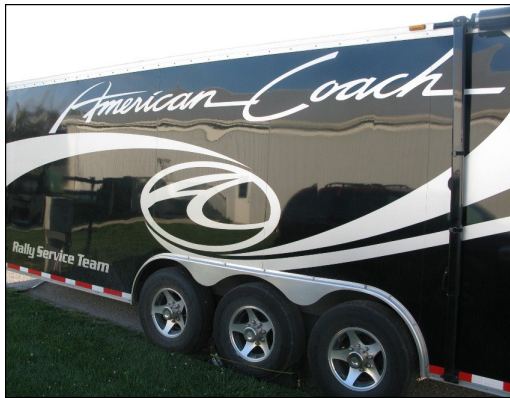
Randy's service crew is popular.