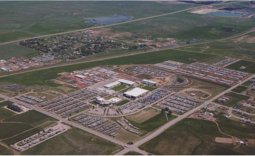
An Aerial View of FMCA in Gillette, Wyoming