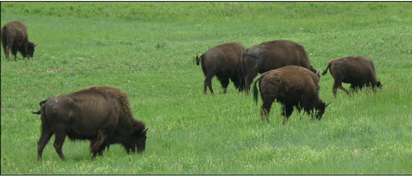
Home, home on the range..... where the buffalo roam..