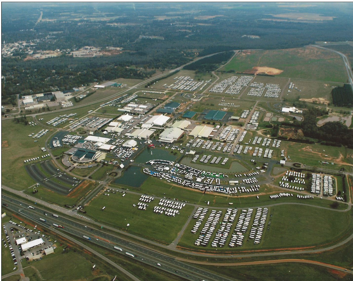
Arial View of FMCA Rally in Perry, Georgia