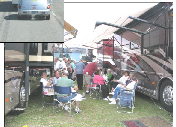
Social Time at FMCA Rally