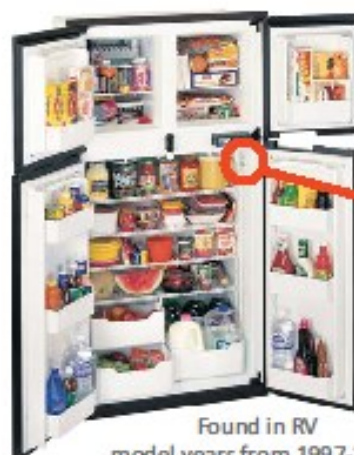
Found in RV model years from 1997-2011