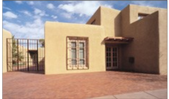
Georgia O'Keefe Museum